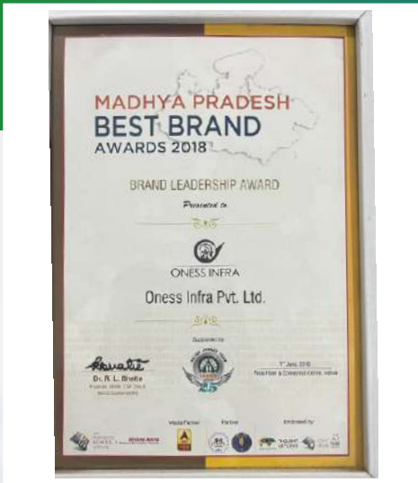
Best brand award 2017-18