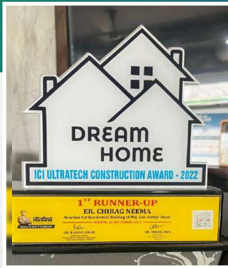
ICMR Ultratech award-2023