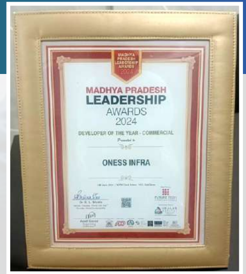
M.P leadership Award-2024