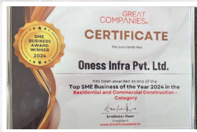
SME Business award 2024